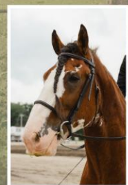
Introducing Finn • Canwest Golden Boy • 2016 Clydesdale Stallion