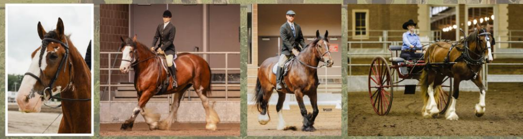
Introducing Finn • Canwest Golden Boy • 2016 Clydesdale Stallion